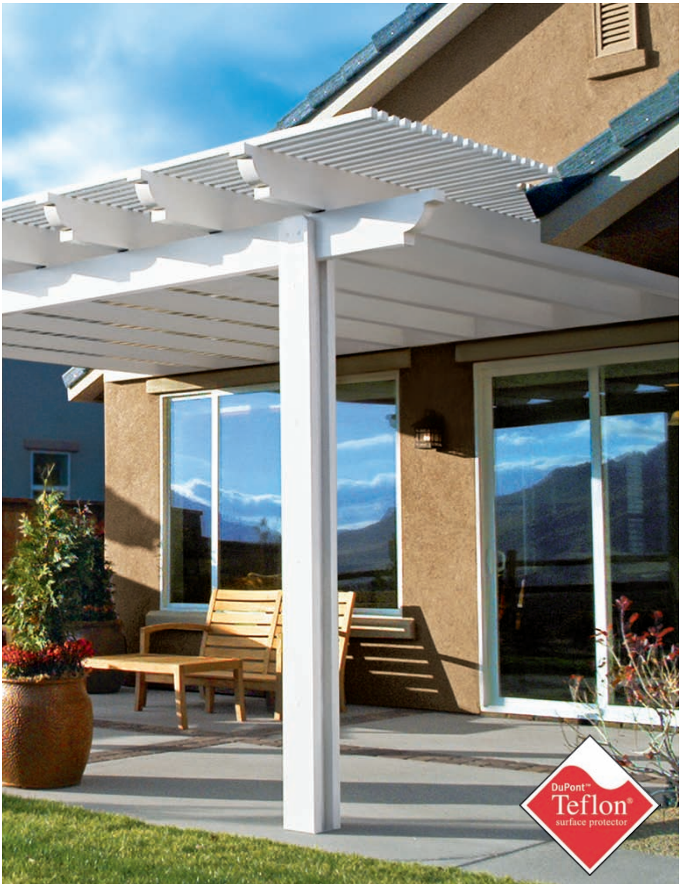
Alumawood™ Shade Structures

PERFORMANCE. STYLE. VALUE. WE'VE GOT YOU COVERED.